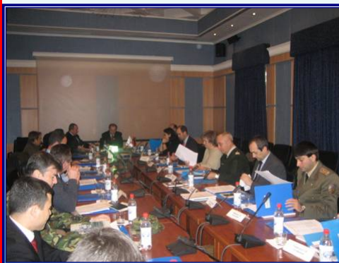
August 2006- National Mine Action Planning Workshop in Tirana