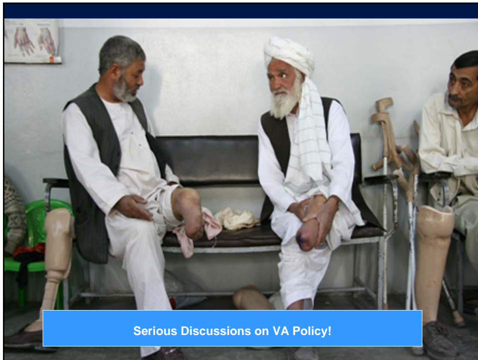
Serious Discussions on VA Policy!