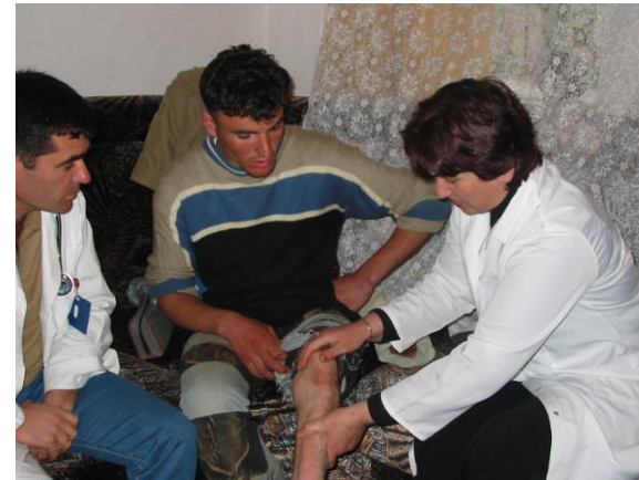
Neurologist and physiotherapist from Kukes Hospital provide rehabilitation to a mine victim.