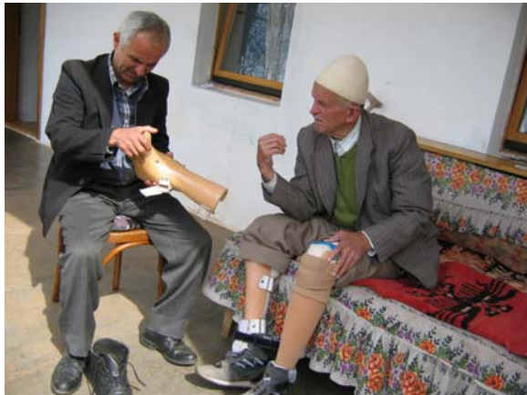
Prosthetic Repair Technician conducting repairs for mine victim in field