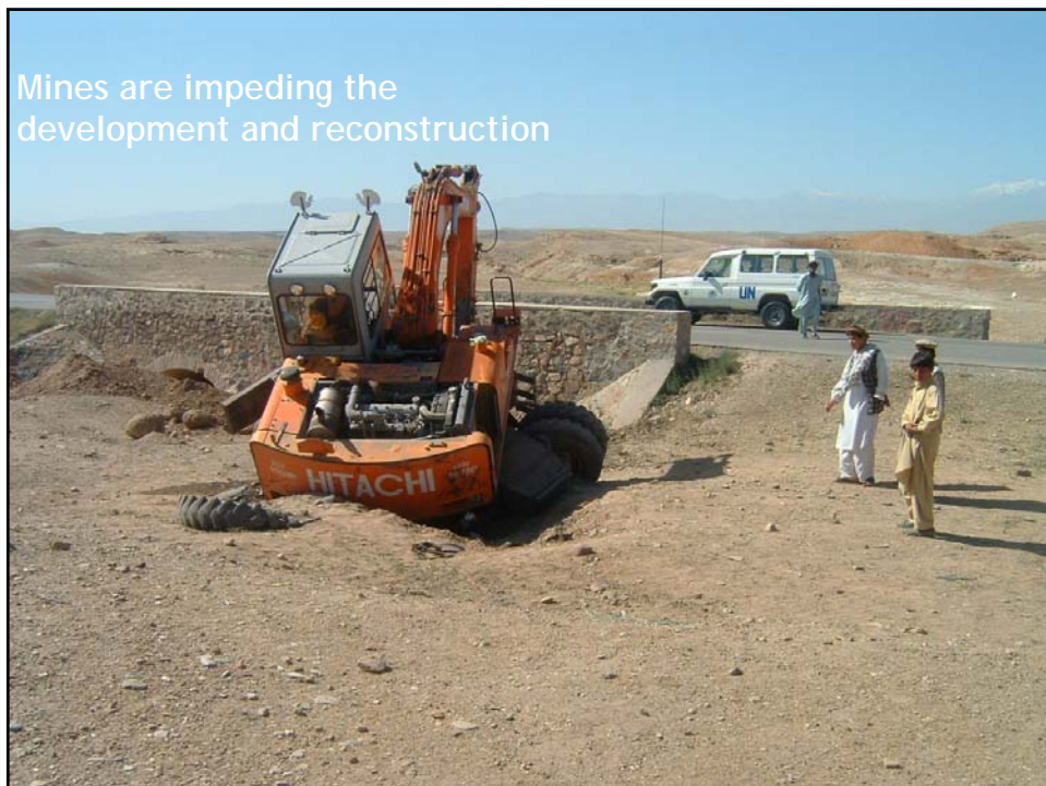
Mines are impeding the development and reconstruction