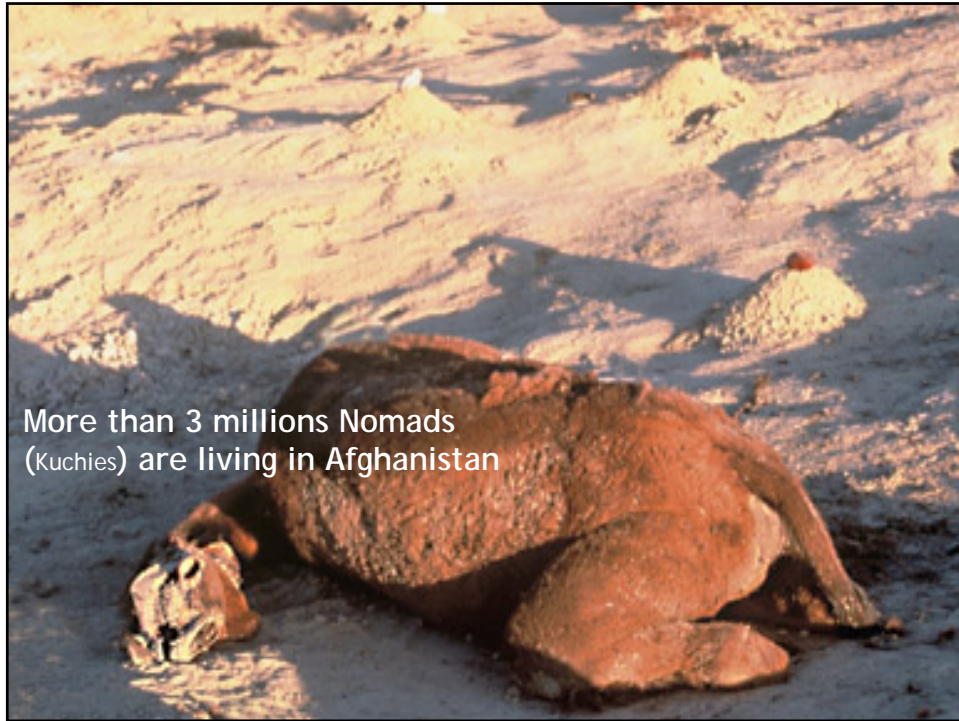
More than 3 millions Nomads (Kuchies) are living in Afghanistan