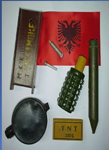
NATO Partnership for Peace (PfP) May 2001.