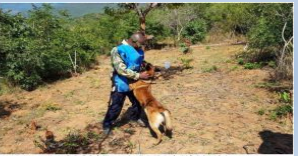
Dog Handler Stanford Manuaramente and Jons sentinating after their first landmine indication

MDDs have were authorised on condition that will not be used as stand alone demining tools