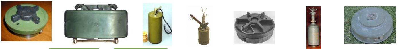
M19 Mk-5 HC PT Mi Ba II TM – 46 TM – 57 TM – 62M TMN-46