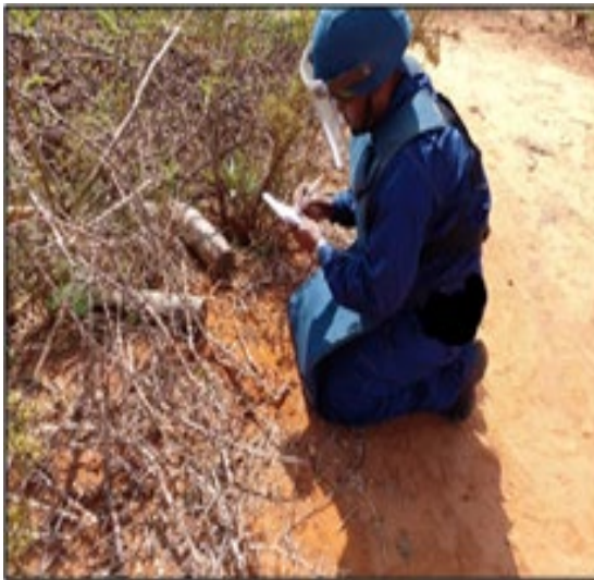
Survey & ERW Clearance