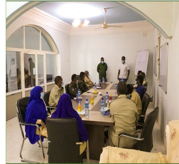
Advocacy & Capacity Building