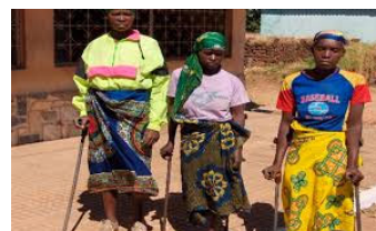
ANDA - National Association for the Disabled in Angola