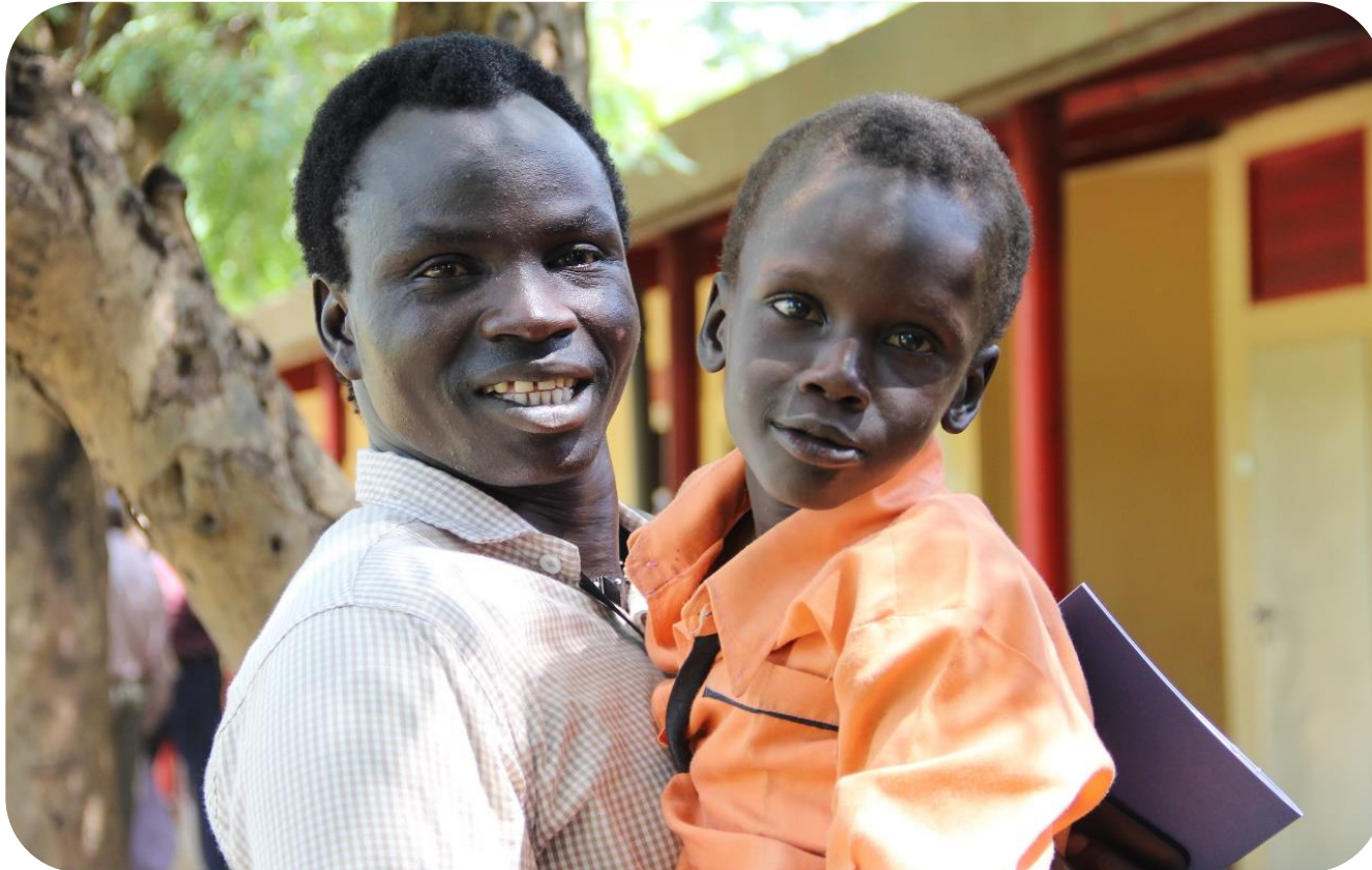
A Director of Social Welfare from Pibor carries a child with disability at OVCI children rehabilitation center