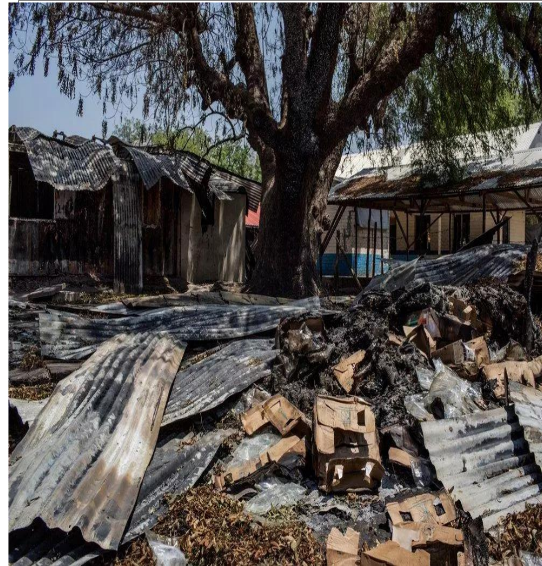
Malakal Teaching hospital on December 2013 was set on fire during war equipment's, buildings, drug, surgical equipment beds where looted and destroyed as reported by MSF South Sudan.