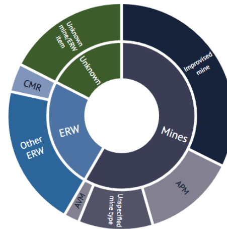
Casualties by type of mine/ERW in 2022