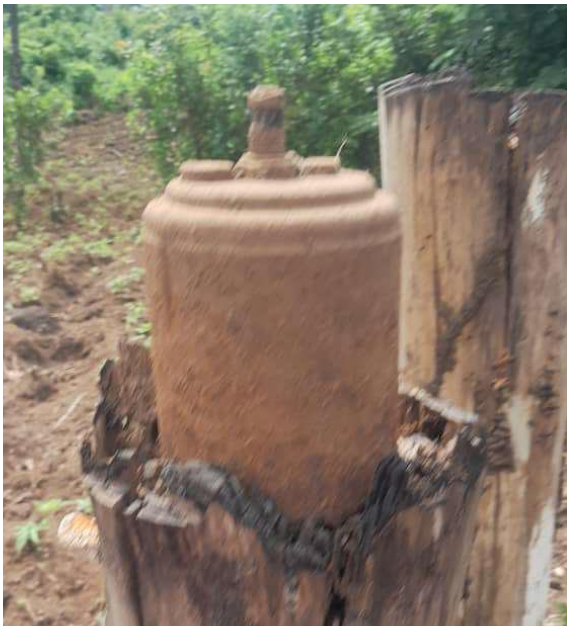
AP mine found in Bambadinca