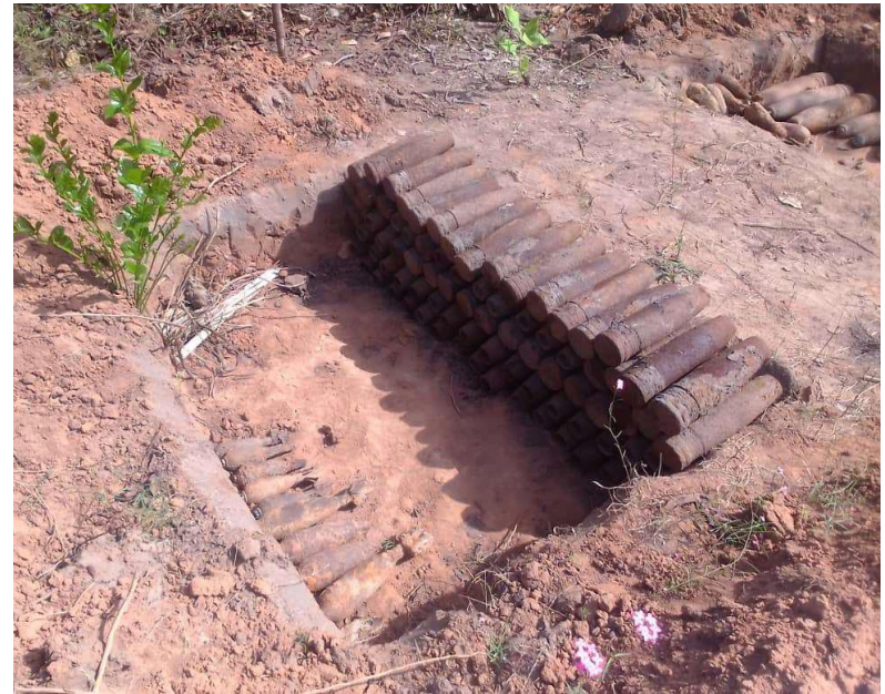
ERW retrieved during the Illonde BAC