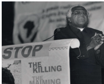
1984 Nobel Peace Laureate Desmond Tutu, seen here, attends both meetings calling for full support of a global landmine ban.