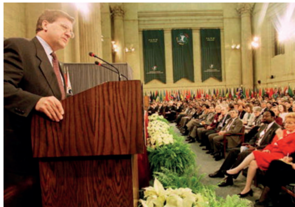
World leaders gather in Ottawa on 3–4 December 1997.

On 3–4 December 1997, representatives of 122 States gather to sign the Convention in Ottawa, thereby taking a fundamental step towards ending the suffering and casualties caused by anti-personnel mines.