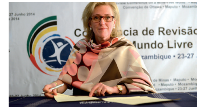
HRH Princess Astrid of Belgium, signing the Maputo Declaration in 2014. Princess Astrid, who has participated in the work of the Convention for nearly two decades, is also a Special Envoy of the Convention.

Ninety-seven (97) countries sign the Brussels Declaration stating their intent to negotiate a treaty banning anti-personnel mines in Oslo in September and to sign it by the end of the year in Ottawa. The Declaration is also presented to the Conference on Disarmament in Geneva.