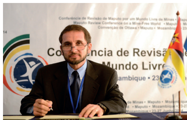
HRH Prince Mired of Jordan signing the Maputo Declaration in 2014. Prince Mired, who has participated in the work of the Convention for over a decade, is also a Special Envoy of the Convention.