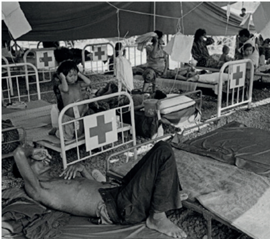
A Red Cross make-shift ward in a refugee camp on the Thai Cambodian border in the late 1990s.

In the late 1980s, the International Committee of the Red Cross (ICRC), humanitarian mine clearance operators and other humanitarian actors on the field encounter staggering numbers of civilian landmine casualties in countries affected by war or in post-conflict situations.