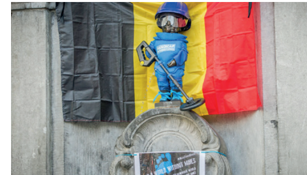
In 2017 Belgium commemorated the 20 years of the Brussels Declaration with an outdoor exhibit in Brussels.

Participating States agree that the Austrian Text serve as a negotiation tool for the next diplomatic conference to be held in Norway.