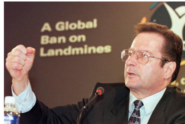
Several months later, the then-Minister of Foreign Affairs of Germany seen here in Ottawa, signs the Convention on behalf of his country.