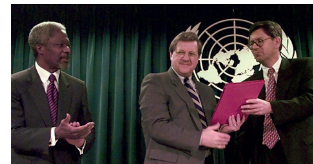
The United Nations is charged with providing official translations of the text and circulating it worldwide to potential signatories. In a special ceremony on 27 September 1997, H.E. Bjørn Tore Godal of Norway hands over the official text to be signed in December in Ottawa, to his Canadian counterpart Hon. Lloyd Axworthy. Then-UN Secretary General Kofi Annan, witness the event.

On 17 September the Plenary agrees to adopt the Text, confirming the willingness of the parties to adopt an unambiguous, comprehensive ban on anti-personnel mines.