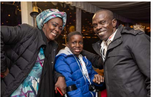
Colombia presided over the 20MSP in 2022 year that also commemorated the 25 years since the signing of the Convention. Various special panels and events took place including the illumination of Geneva's iconic Jet d'eau in Convention colours.