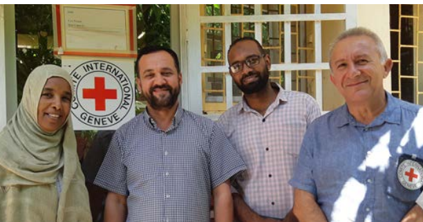
Sudan hosted a National Stakeholder Dialogue on Victim Assistance that sought to provide last comments to its National Strategy on Disability.