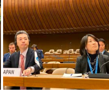
Germany presided over the Eighth Pledging Conference on 24 March 2023 in Geneva. Minister of State H.E. Katja Keul offered opening remarks.