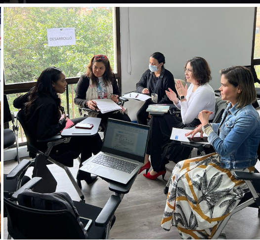
In Bogota, Colombia hosted four preparatory meetings prior to its National Stakeholder Dialogue on Article 5 which provided a wide array of inputs for its national authority and clearance programme as part of its Total Peace strategy.