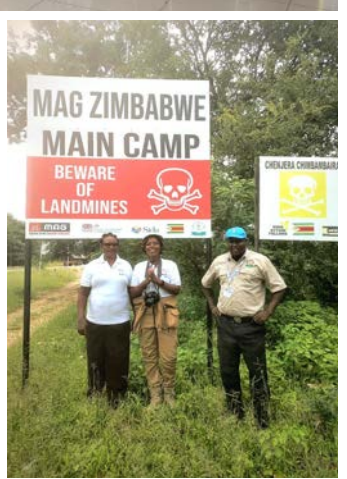
A National Stakeholder Dialogue for a Mine-Free Zimbabwe by 2025 took place in Harare in January. The Zimbabwean Mine Action Centre will launch the meeting report and plan for follow up during a Briefing hosted by the Delegation of the European Union on Tuesday 21 November.