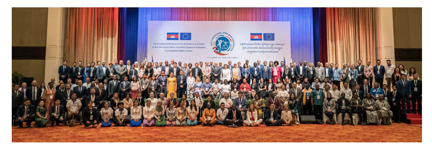
Third Global Conference on Victim Assistance in a Disability Rights Context: For Greater Inclusion

The Third Global Conference on Assistance to Victims of Anti-Personnel Mines and Other Explosive Ordnance in a Disability Rights Context: For Greater Inclusion took place in Phnom Penh, Cambodia from 17-19 October 2023. The meeting aimed to reflect, inspire, learn, and empower as it built on previous global conferences hosted by Colombia (2014) and Jordan (2019).